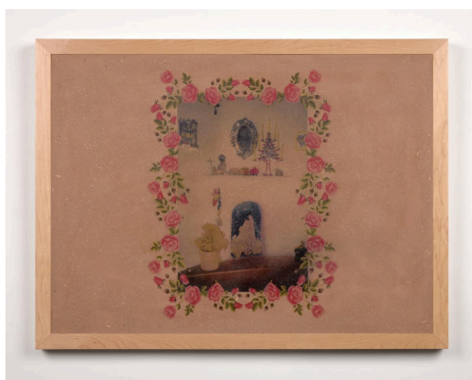
Joanna Keane Lopez, La Sagrada , 2025, Acrylic inkjet print on adobe, 30 x 40 x 1½ in.

Museums are often celebrated for the art they display, but much of the work that makes those experiences possible happens behind the scenes. Annual operating support sustains the Harwood's mission every day: caring for our collection, presenting meaningful exhibitions, supporting