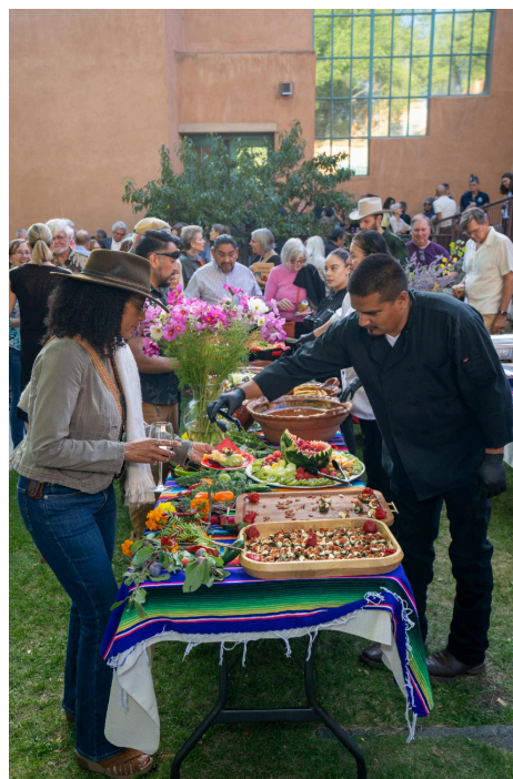
Opening celebration, Nicholas Herrera: El Rito Santero , September 21, 2024—June 1, 2025.

As a valued member of Harwood Museum of Art, you enjoy the following benefits: