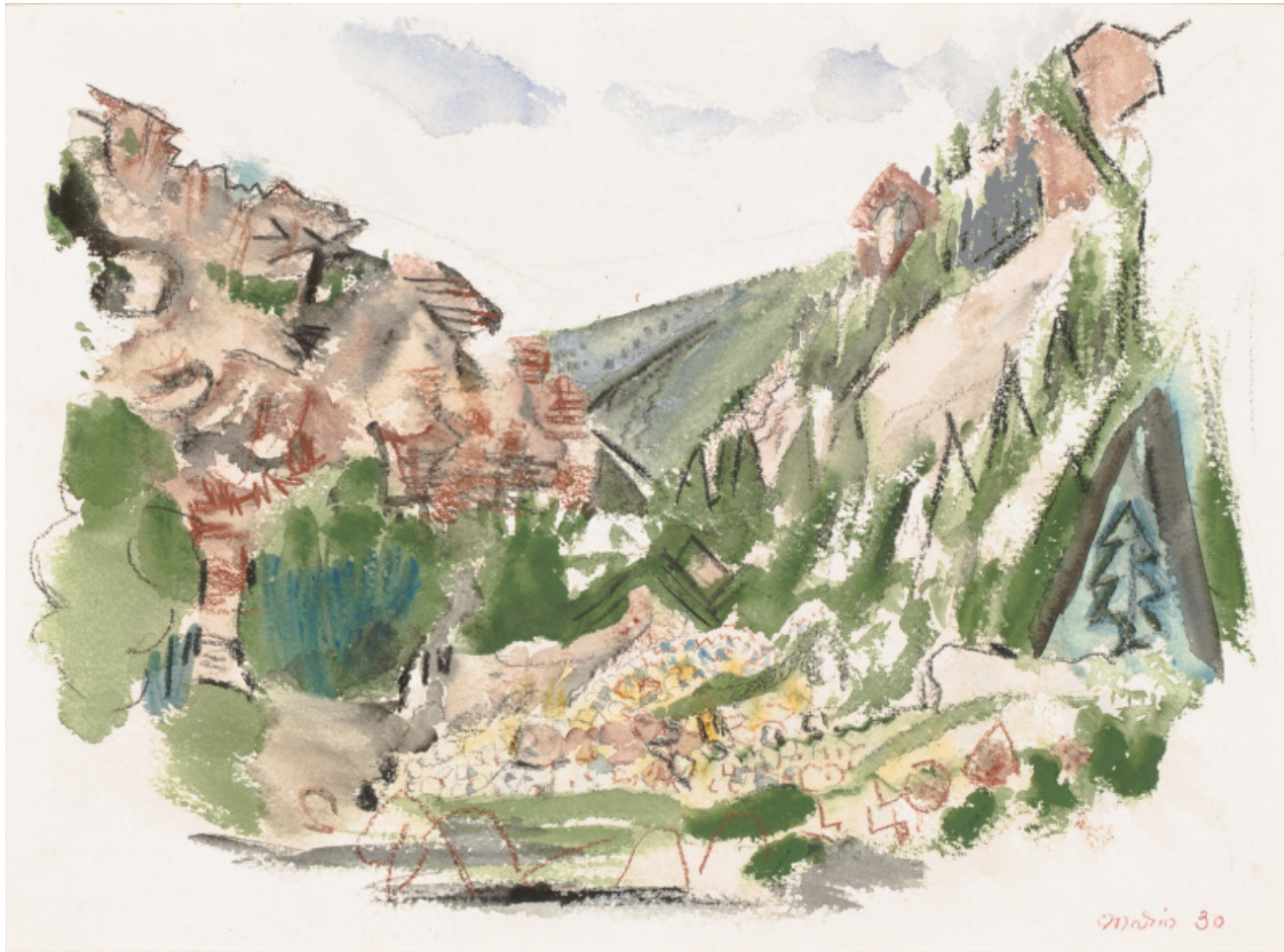
John Marin, Taos Canyon , 1930, Watercolor, 15 9/16 x 20 1/2 in. (39.5 x 52 cm) Framed: 21 3/4 x 27 x 1 3/8 in. (55.2 x 68.6 x 3.5 cm), Museum Purchase, 1995.0022.0000