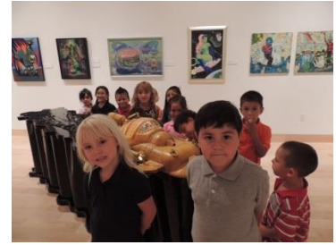
¡ORALE! Kings and Queens of Cool! Introduced students to Pop Surrealism broadening visual literacy and celebrating the current culture of Northern New Mexico and its relationship to current national culture.